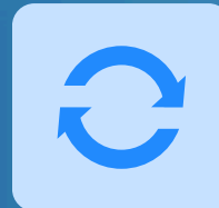
Bi-Directional Data Synchronization