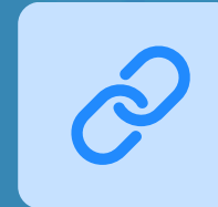
Inbound Document Linking