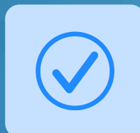
Task & Process Workflow Automation