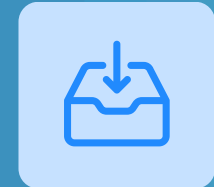
Document Generation Archiving