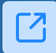
Outbound Attachment Archiving