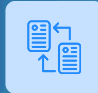
Recurring File Transfers