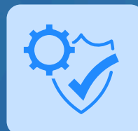
Governance & Compliance