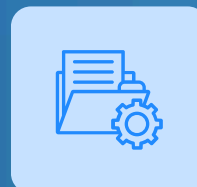
Enhanced In-App Document Management Experience